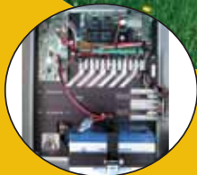
12" x 14" pre-wired Ecosol Libra enclosure with batteries