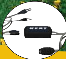
ECOSOL Charger for rapid charging of batteries from standard electrical outlet