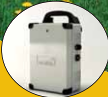
Ecosol easy to connect interface with batteries