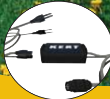
ECOSOL Charger for rapid charging of batteries from standard electrical outlet