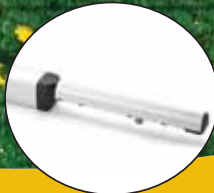
Phobos BT & BT L 24V DC operators for swing gates up to 16.5' & 550 lbs