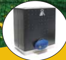
Deimos BT 24V rack & pinion slider operator for gates up to 1,100 lbs