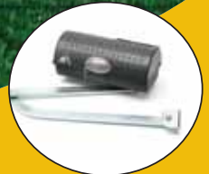
Igea BT 24V articulated arm for gates up to 550 lbs